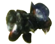
Bay Mussel ( Mytilus Galloprovincialis )