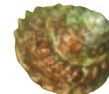
Wavy Turban Snail ( Lithopoma Undosum )