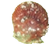
Giant Rock Scallop ( Crassadoma Gigantea )