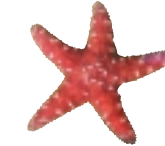
Ochre Starfish ( Pisaster Ochraceus )