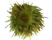
Aggregating Anemone ( Anthropleura Elegantissima )